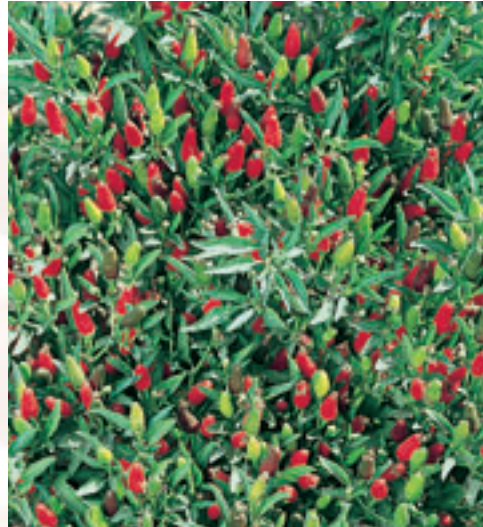
Thai Hot Ornamental

Ornamental bedding plant, twelve to fifteen inch tall plants, covered with clusters of two inch oval fruits. Fruit colors include: yellow, orange, red and purple, sweet thick walls, are used for pickles or fresh salads.