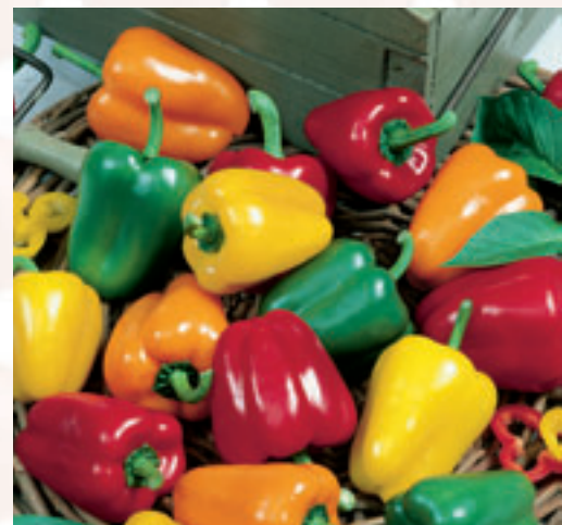
Mini Bell Blend

Beautiful ornamental pepper with hundreds of small one inch, conical upright fruit in all color shades including: yellow, purple, orange and red. Plants are tall, two feet in height and make an excellent addition to any garden